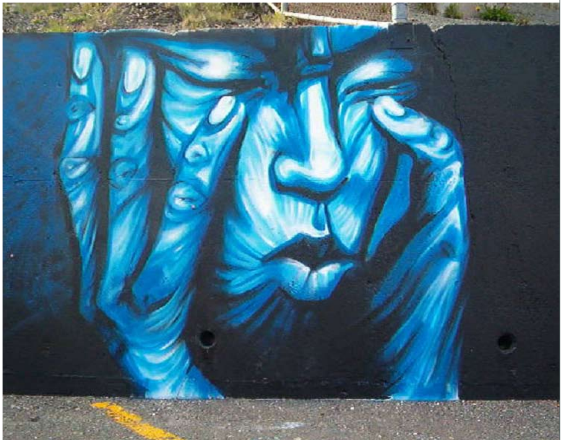
Mural by youth in downtown St. John’s