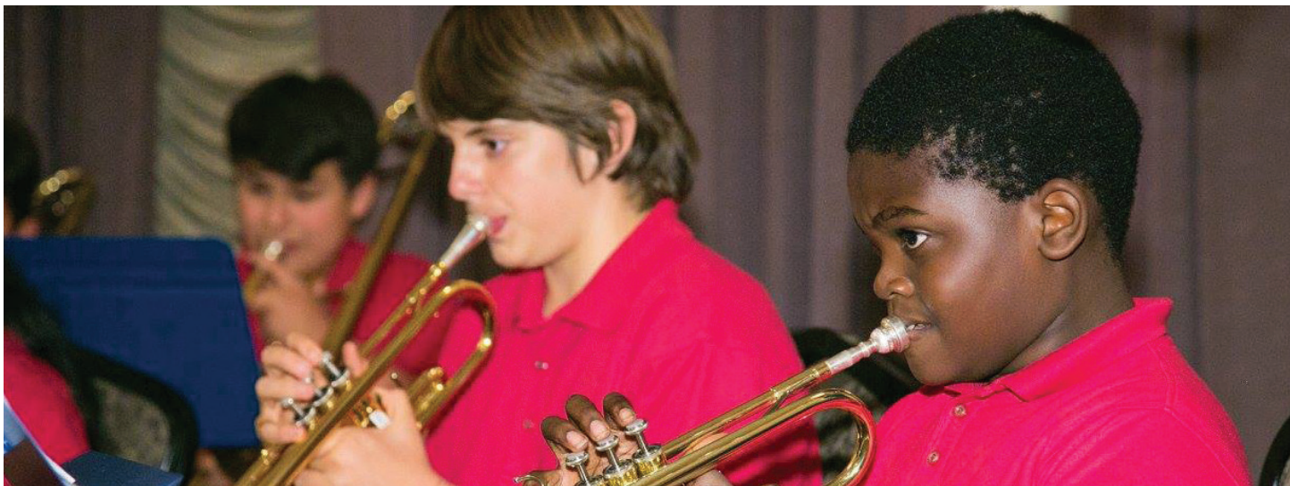
Bravo Youth Orchestra.