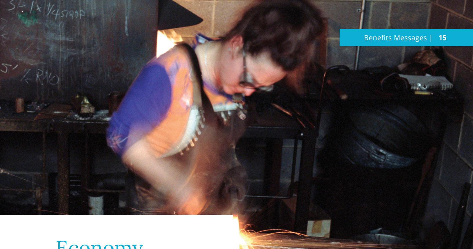
Blacksmith at the Penland School of Crafts.