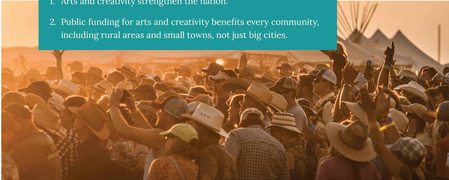
Red Arts Pants Festival.