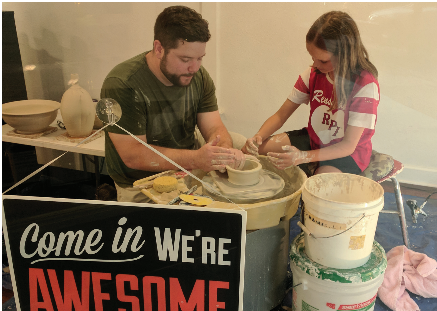
Pottery Demonstration.

The USDA’s Rural Establishment Innovation Survey has shown that rural counties with performing arts organizations experience population growth three times higher than those without, provide residents with higher incomes, and recover more quickly from recession (National Endowment for the Arts, 2017).