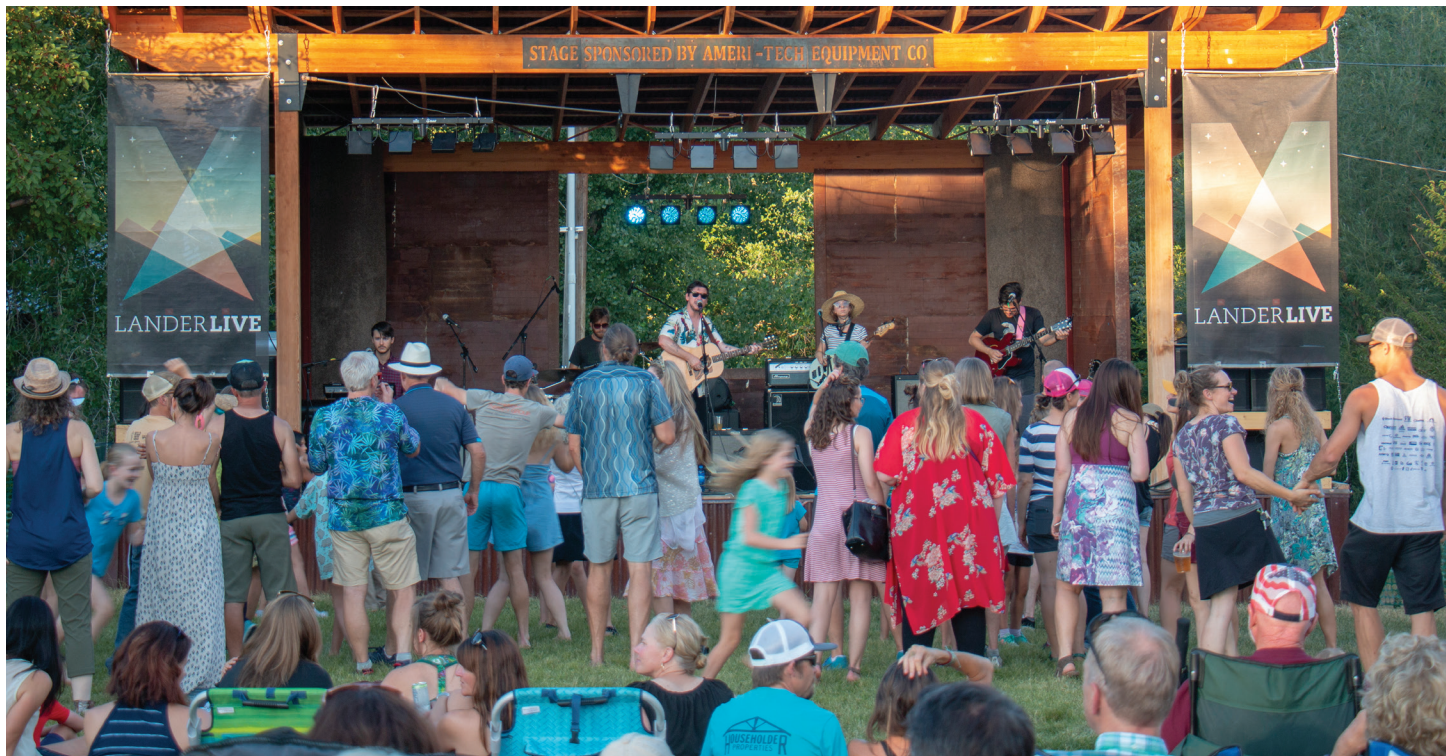
Lander Live.

The probability that a business will be a substantive innovator rises from 60% in rural counties that host no performing arts organization to 85% in the rural counties that host four or more organizations (National Endowment for the Arts, 2017).