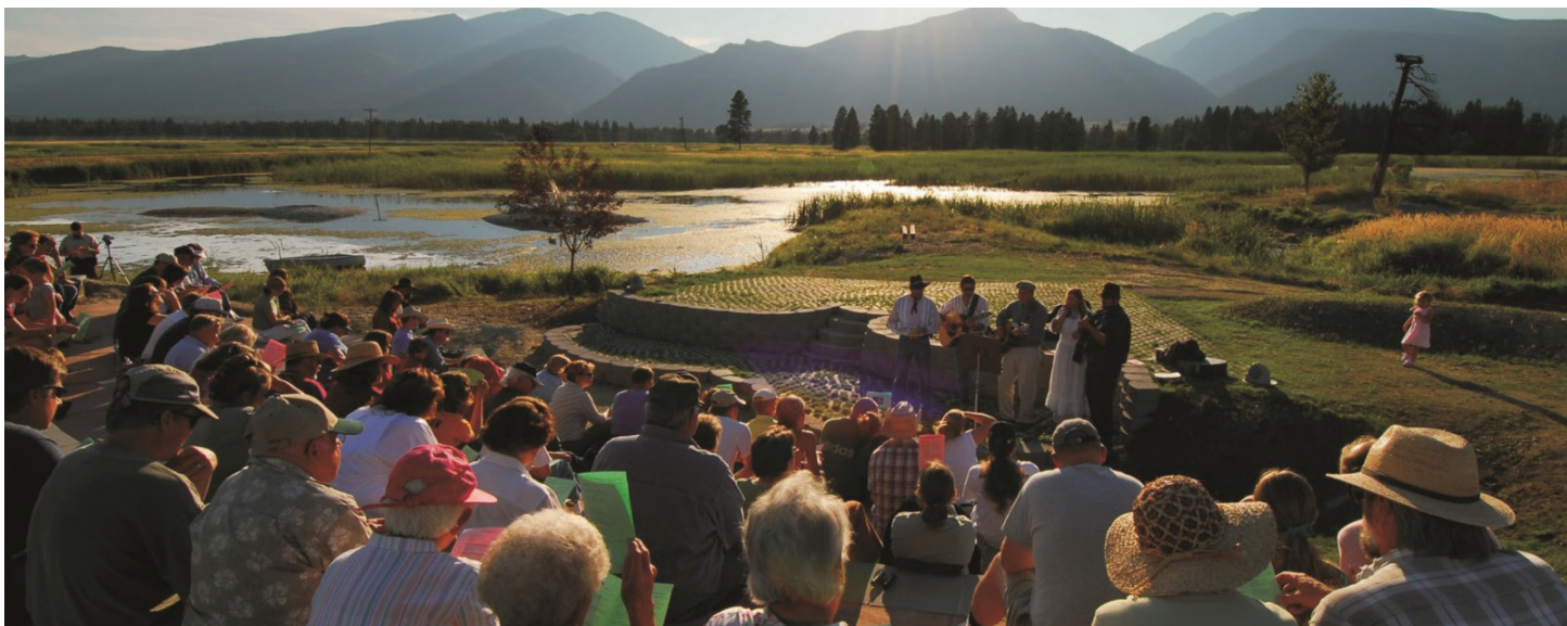
Concert at the Lee Metcalf Wildlife Refuge.