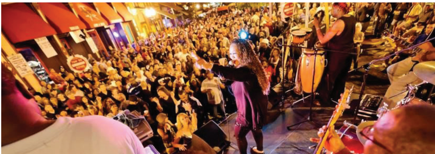
Coalition at Crown Royal's Big Muddy.

Research dating back to 2002 shows a clear positive association between the prevalence of artists in a workforce and economic dynamism, including increases in high-tech employment and new businesses (Florida, 2002).