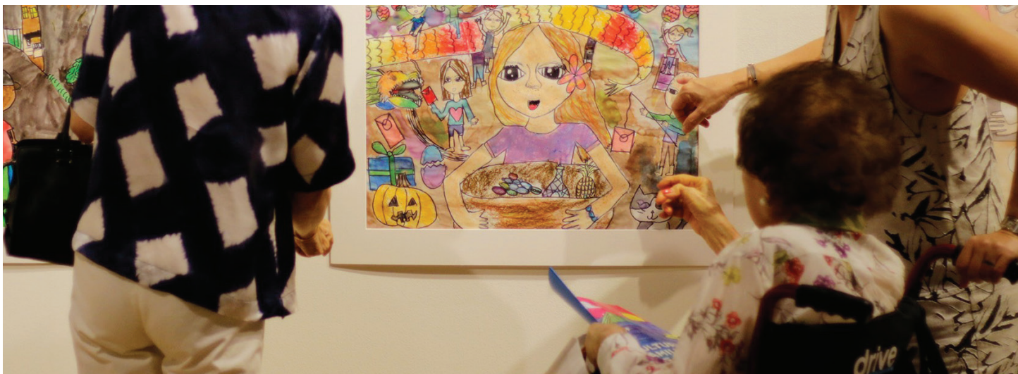
Young Artists of Hawai'i exhibits 2019.

Engagement in artistic activities are also linked with healthy brain function that supports memory processes, serotonin production and positive emotional states, and spatial-temporal processing (Kruk et al., 2004). Artistic activities and the multi-sensory experiences they provide have been shown to support memory retention and brain health at every stage of life.