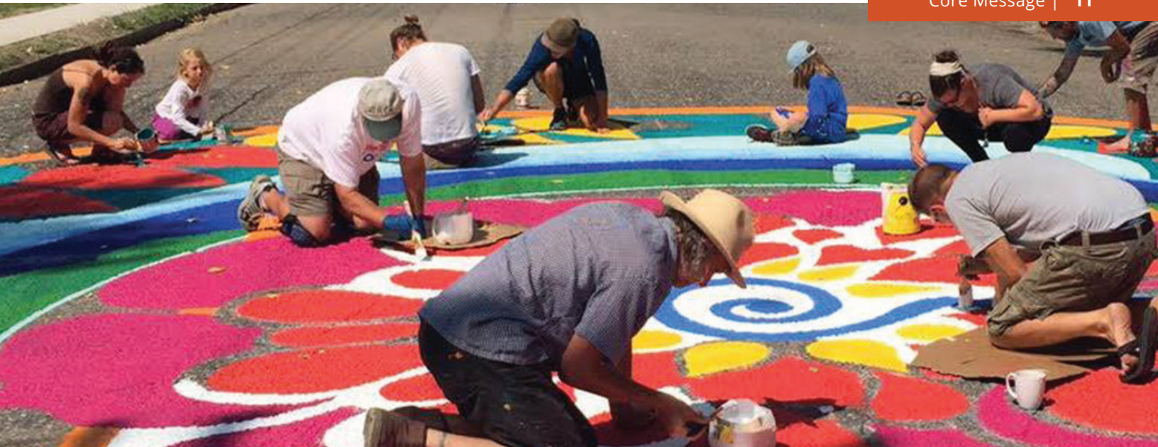
Street mural in Paonia, Colorado, involving more than 200 community members.