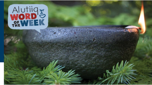
An ancestral stone lamp burning seal oil.

Koniag, Inc. will partner with the Alutiiq Museum and Archaeological Repository to make 22 seasons' worth of Alutiiq "Word of the Week" lessons accessible. Alutiiq Museum staff will record audio, write text, and draft graphics to accompany new lessons, and older lessons' missing components. The lessons will be added to the museum's collections management database which will be made public and available from the museum's website, so that anyone can search, download, and explore the online Alutiiq Word of the Week archive.